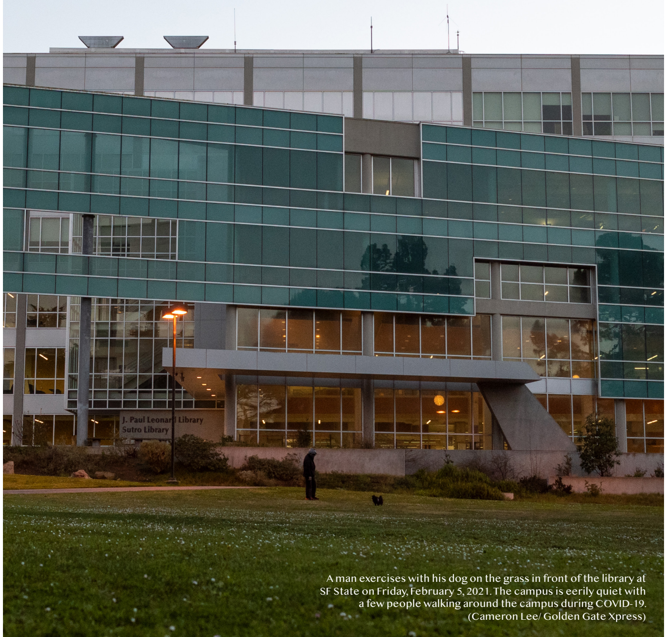
A man exercises with his dog on the grass in front of the library at SF State on Friday, February 5, 2021. The campus is eerily quiet with a few people walking around the campus during COVID-19.