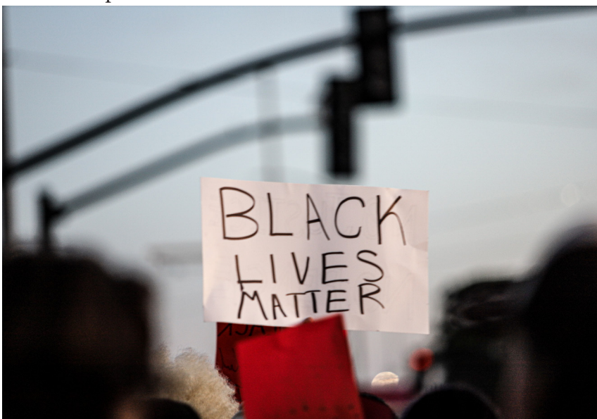
Participants of the "No Justice, No Peace" protest march to Daly City City Hall on Tuesday, February 7, 2023. The protest was held in honor of Tyre Nichols, a Black man killed by police in Memphis, Tenn.