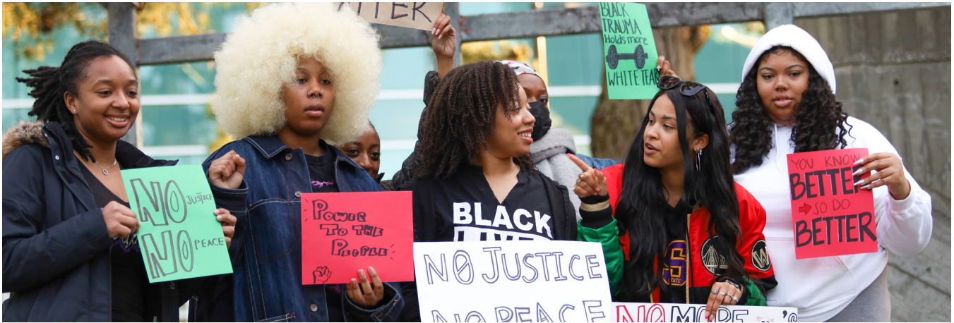
Members of SF State's Black Student Union (BSU) hold signs outside of the Cesar Chavez Student Center to protest police brutality on Tuesday, Feb. 7, 2023. Two members of the BSU organized the protest in honor of Tyre Nichols, a Black man killed by Memphis police officers last month.