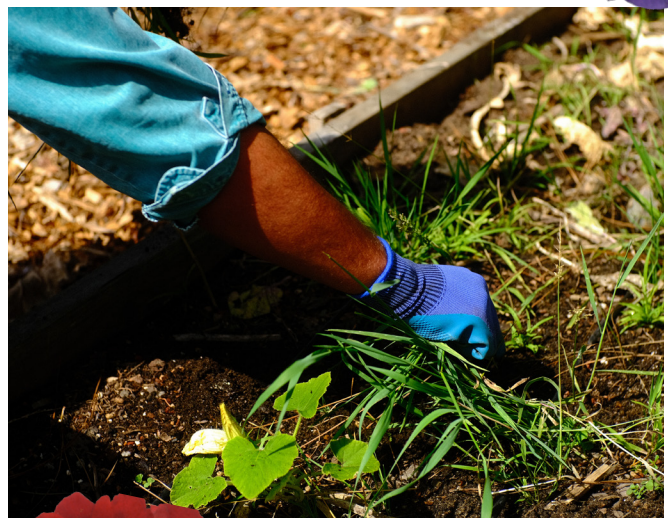
The Sol Patch Garden was established in 2007 and is now managed by the Associated Students’ Environmental Resource Center. The garden is being tended to again after a two-year hiatus due to the pandemic.